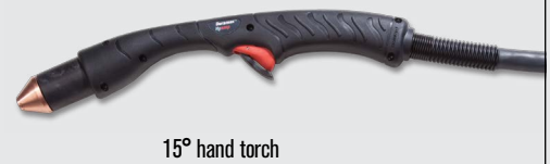
15° hand torch