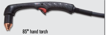
85° hand torch

(for more torch options, see www.hypertherm.com )